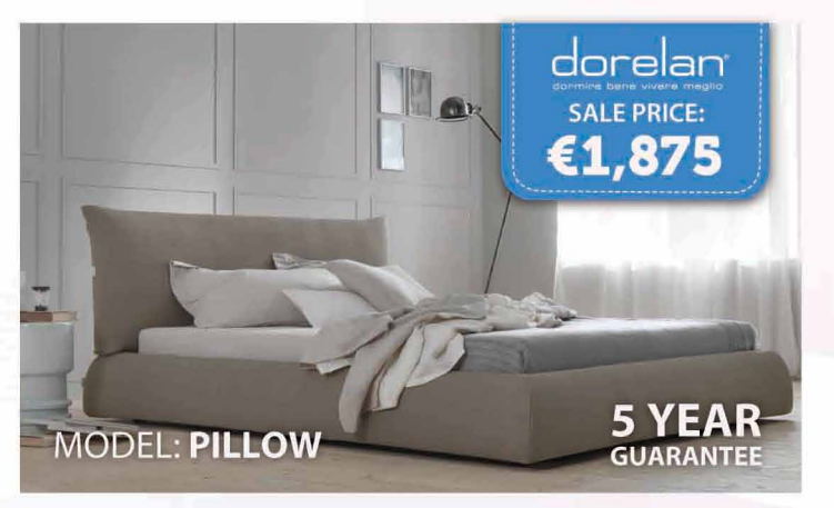
UPHOLSTERED BED WITH TILTING SLATTED BASE & STORAGE SPACE: 160 X 200 CM FABRIC CATEGORY A