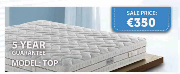
400 SPRINGS MATTRESS Prices based on 160 X 190cm, more sizes available