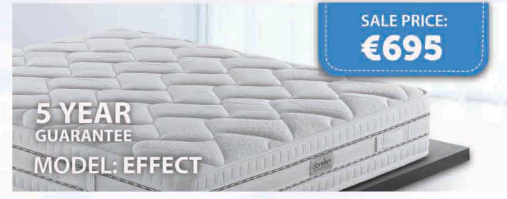
800 POCKET SPRINGS MATTRESS Prices based on 160 X 190cm, more sizes available