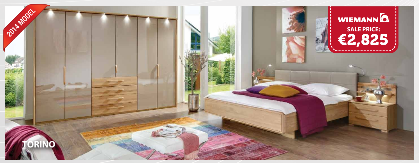
FOLDING DOORS WARDROBE WITH 4 DRAWERS | 4 SAHARA GLASS DOORS & 2 MIRRORED DOORS BED WITH MAGNOLIA UPHOLSTERED HEADBOARD: 180 X 200cm | SLATTED BASE | PAIR OF NIGHT CABINETS INCLUDING WALL PANELS