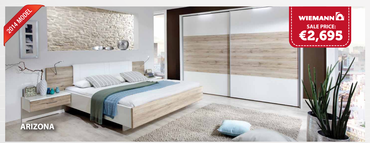
SLIDING DOORS WARDROBE: W. 300 X H. 217cm \mid SOFT CLOSING MECHANISM \mid INTERNAL COMPARTMENT DIVIDER BED FRAME: 160 X 200cm \mid HEADBOARD CUSHION \mid PAIR OF BEDSIDE CABINETS \mid CHEST OF DRAWERS