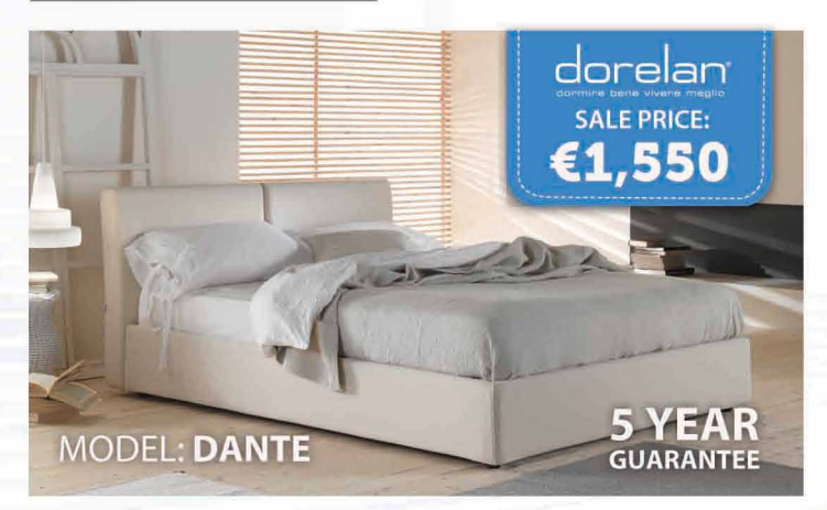
UPHOLSTERED BED WITH TILTING SLATTED BASE & STORAGE SPACE: 160 X 200 CM FABRIC CATEGORY A