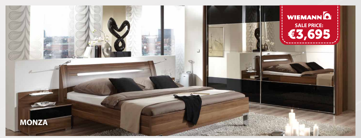
SLIDING DOORS WARDROBE: W. 300 X 236cm | SOFT CLOSING MECHANISM | BED WITH ANGLED HEADBOARD:160 X 200cm HEADBOARD CUSHION | PAIR OF BEDSIDE TABLES | CHEST OF DRAWERS | SLATTED BASE