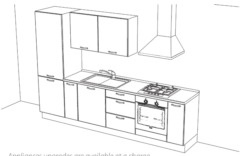
Appliances upgrades are available at a charge. Terms and conditions apply on kitchens and appliances offer

FREE BOSCH APPLIANCES WITH EVERY NOBILIA KITCHEN