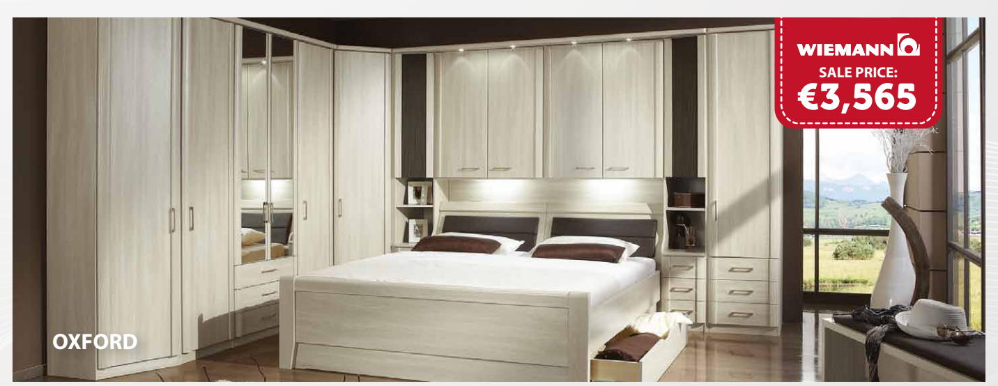
4 DOOR WARDROBE, MIDDLE MIRROR DOORS | PLUS 3 DRAWERS | END UNIT | CORNER WARDROBE | BRIDGE WITH OCCASIONAL ELEMENTS BED FRAME: 160 X 190cm WITH SLATTED BASE | HEADBOARD CUSHIONS | PAIR OF BED STORAGE DRAWERS | 50cm UNIT WITH DRAWERS