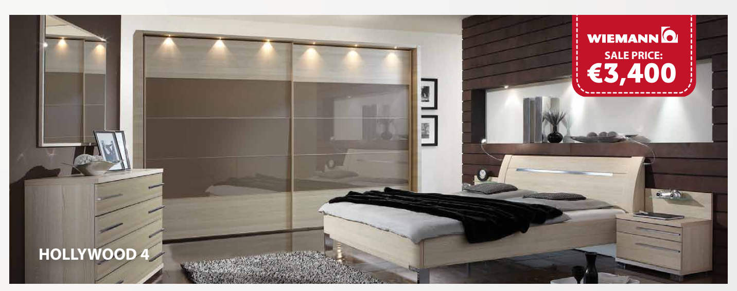
SLIDING DOORS WARDROBE: W. 300 X H. 236cm \mid BED WITH CURVED HEADBOARD: 160 X 190cm \mid SLATTED BASE PAIR OF BEDSIDE TABLES \mid LARGE CHEST OF DRAWERS