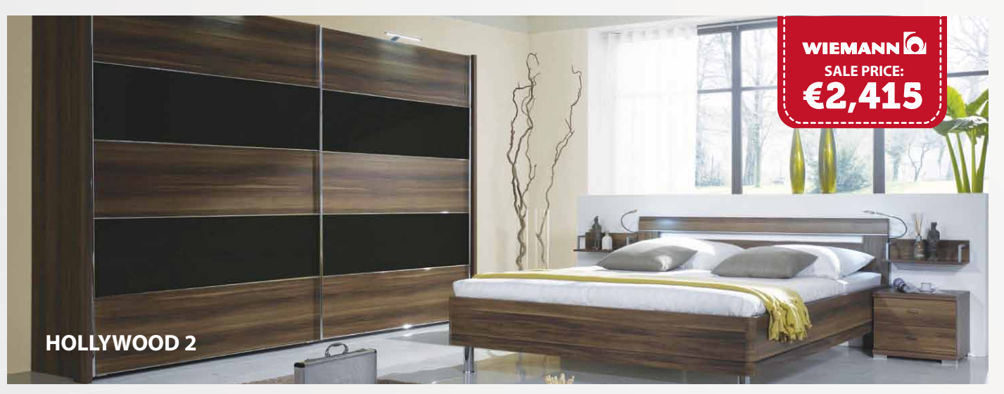
SLIDING DOORS WARDROBE: W. 300 X H. 217cm \mid BED FRAME: 160 X 190cm WITH SLATTED BASE PAIR OF BEDSIDE TABLES \mid CHEST OF DRAWERS. W. 75cm

(prices excluding mattresses & lighting fixtures)